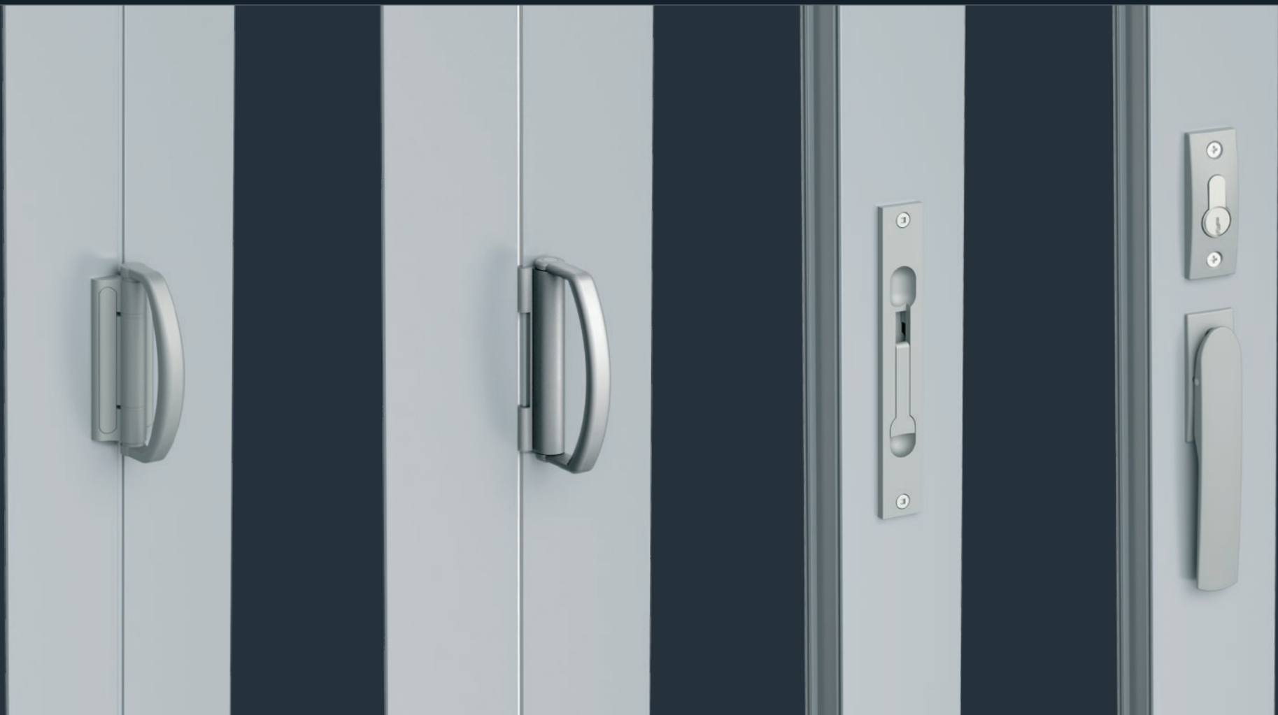
Twin bolt lever